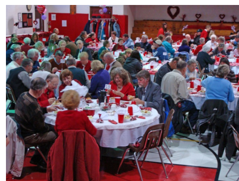
A sold out crowd.