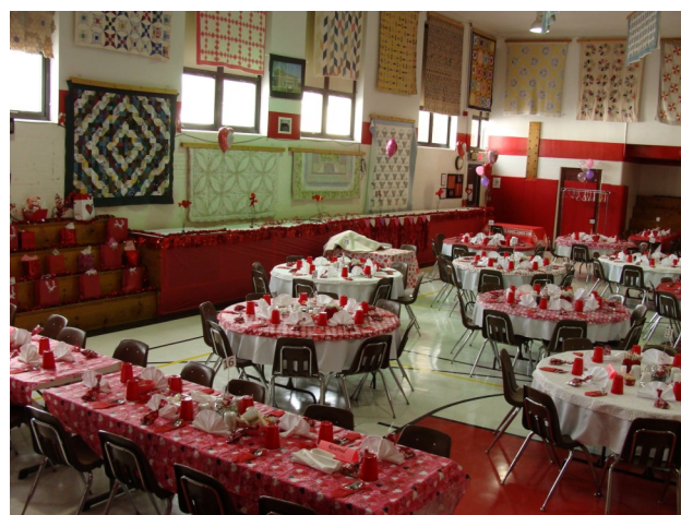
Beautifully decorated for a special day.