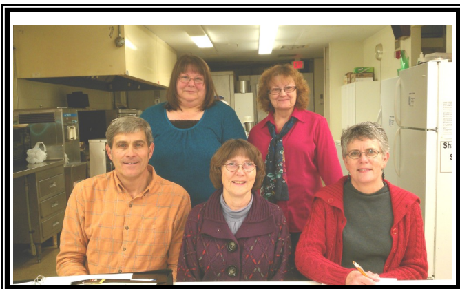
2012 SCCA Officers (from left to right)