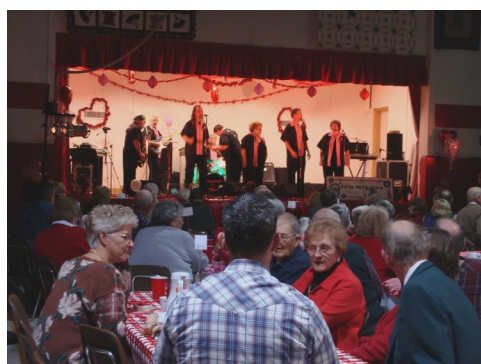
Enjoying "Remember Then".